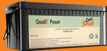
1x 24V / 100AH Lithium Battery