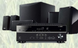
60 Watt Hifi