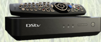
50 Watt Decoder