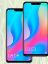
20 Watt Cellphone Chargers