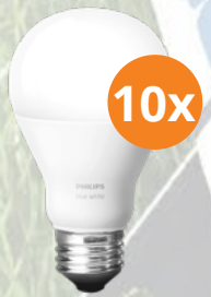
10 Watt LED Bulbs (100W Total)