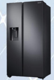
120 Watt Fridge (Energy Star)