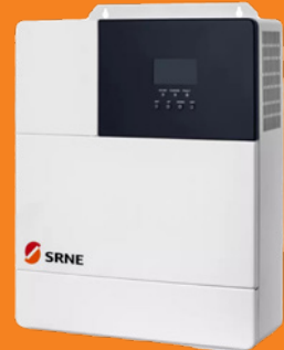
3kVa SRNE Hybrid Inverter