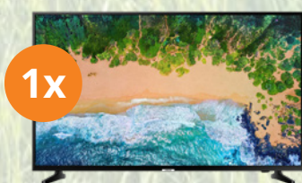
75 Watt 42" LED TV